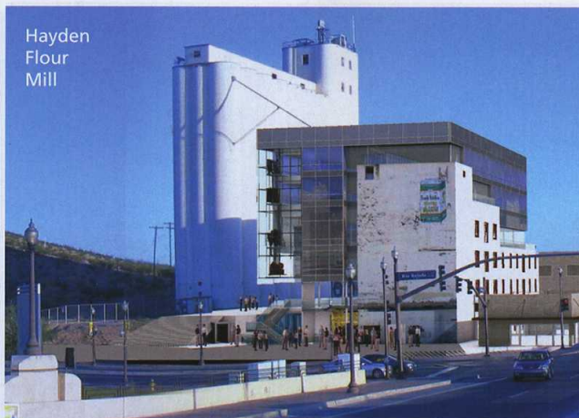
Hayden Flour Mill